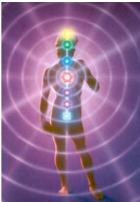
The picture of the human being and its 7 basic chakras.

Also like with every kind of feeding it's important not to drain too much of a persons energy, and never to drain someone "empty", because when you feed upon one person for a long time you can cause many problems for that person, like becoming ill, depressed etc.