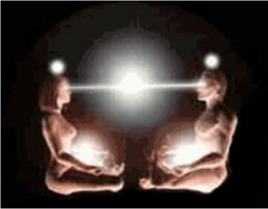
Picture of two persons that are linked with each other