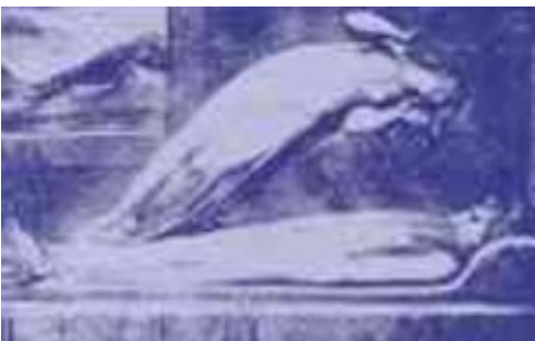
A picture of an out of body experience

Astral Projection is the same thing as an OBE (out of body experience). It means going out of your body and travel between the living world as we know it by our physical eyes and other senses, and the "world of the dead". Some people call this world the 'astral world'. There are many books about OBE and many people who had this experience.